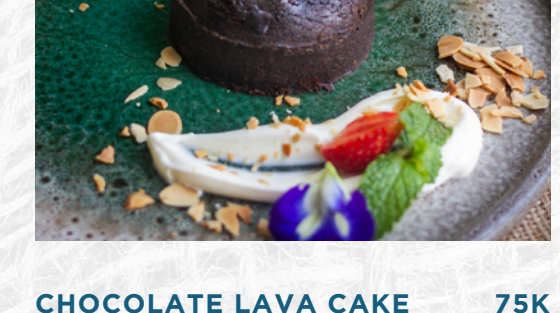
CHOCOLATE LAVA CAKE WITH ALMOND CRUMB AND WHIPPING CREAM