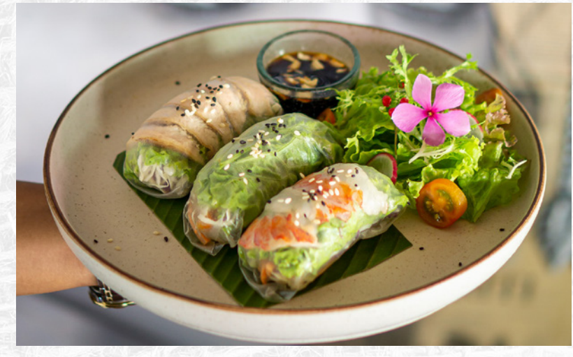
TRILOGY SUMMER ROLL 170K Three kinds of fresh summer roll (veggie, chicken, prawn) with Japanese soya sauce.