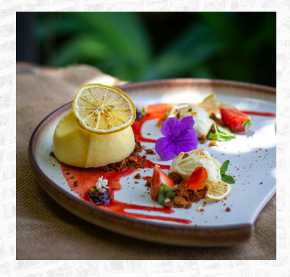
CREAMY LEMONADE 80K WITH ALMOND CRUMBLE