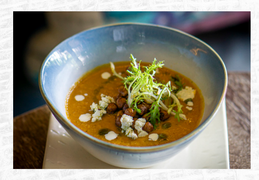
CREAMY TOMATO & CHICKPEAS SOUP Creamy tomato soup, roasted chickpeas, feta cheese, coriander oil.

PLAGE MINESTRONE AL PESTO Seasonal diced vegetable, tomato essence, herb pesto, basil and shaved parmesan cheese.